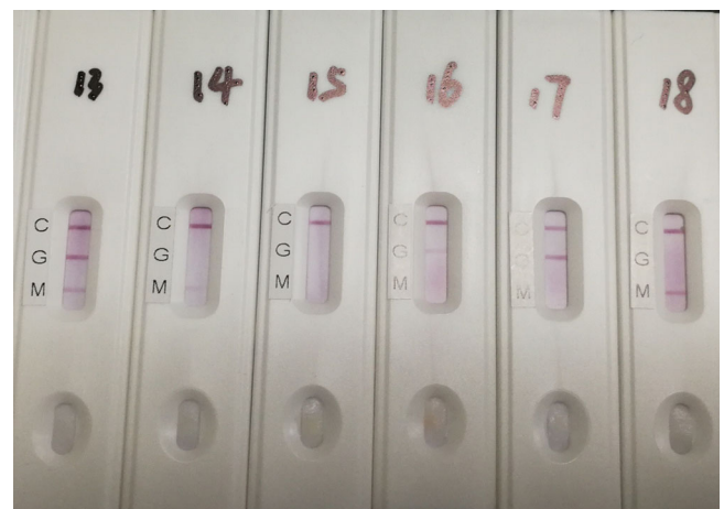
FIGURE 2 Representative photo for different patient blood testing results. (#13) Both IgM and IgG positive, (#14) IgM weak positive, (#15) Both IgM and IgG negative, (#16) IgG weak positive, (#17) IgG positive, and (#18) IgM positive. IgG, immunoglobulin G; IgM, immunoglobulin M

cartridge #15, no IgM and IgG; in cartridge #16 IgG only in low concentration; in cartridge #17 IgG only in high concentration and in cartridge #18, IgM only in high concentration in patient bloods, respectively.