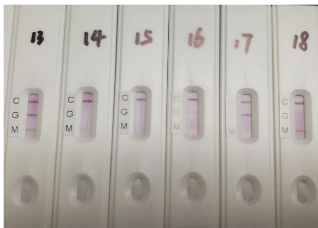
Table 1. The detection sensitivity and specificity of SARS-CoV-2 IgG-IgM combined antibody reagent.